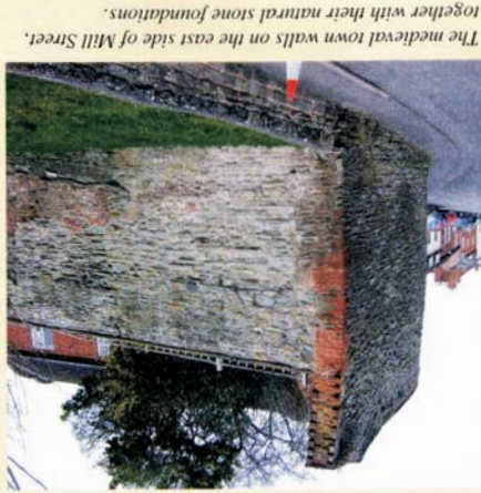
The medieval town walls on the east side of Mill Street, together with their natural stone foundations.

The first wall were built for the defence of the Norman castle, in the late 11th C. Walls to encircle the town, partly for defence and partly to control entry (and raise funds through tolls) were constructed in the medieval period, probably initially as earth mounds supporting a wooden fence but later strengthened by use of stone, in the mid 13th C. After the castle was abandoned, on the closure of the Council of the Marches in the late 17th C, the structure fell into dereliction. This provided a source of recycled stone for Georgian development in the town, not for houses (since fashion now favoured brick) but for enclosing gardens and orchards (notably along Linney and Corve Street).