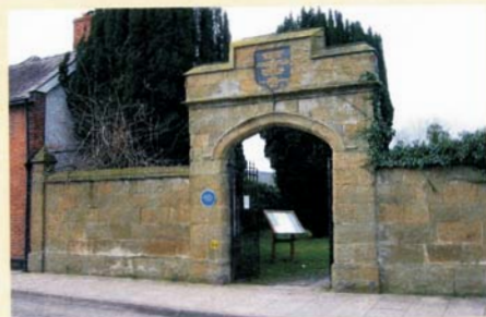
The stone entrance to St Leonard's churchyard, off Corve Street north of the town centre, constructed in the 19th Century utilising stone from the demolition of a Carmelite Monastery which once occupied the site.

The Ludlow Town Walls Trust now oversees the maintenance of the walls, raising funds to assist repairs and conservation work by the local authority and landowners.